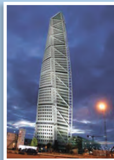
Turning Torso in Malmö.

Right next to Malmö there is the ancient university city of Lund. As long ago as the year 1085, a Cathedral School for the education of priests was founded. Today, Lund University is the largest university in Scandinavia with more than 34,000 students enrolled.